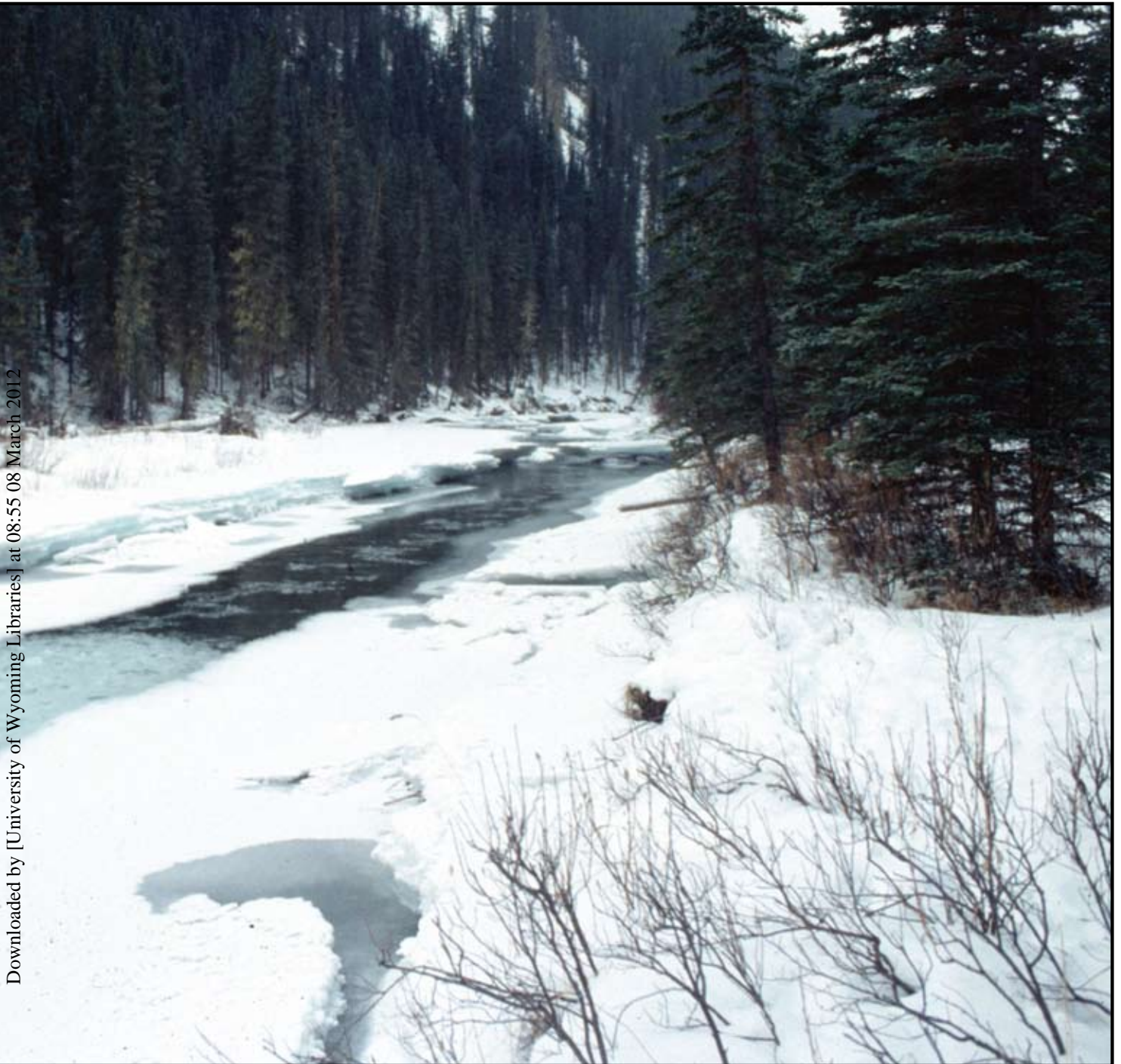
Figure 6. Frazil slush forming stationary surface ice on the North Ram River, Alberta.

Downloaded by [University of Wyoming Libraries] at 08:55 08 March 2012