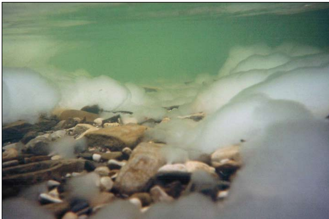
Figure 2. An underwater photograph of anchor ice clinging to the bottom of Dutch Creek, Alberta.

interstitial water among the initial ice floes forming the ice cover freezes (Calkins 1979).