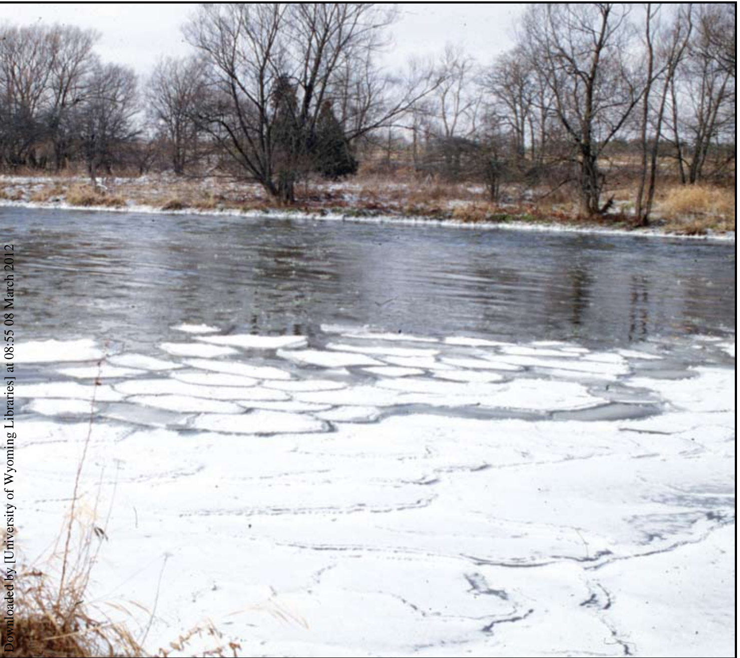
Figure 5. Pans of frazil slush forming stationary surface ice in a small backwater area along the edge of the Grand River, Ontario.

Downloaded by [University of Wyoming Libraries] at 08:55 08 March 2012