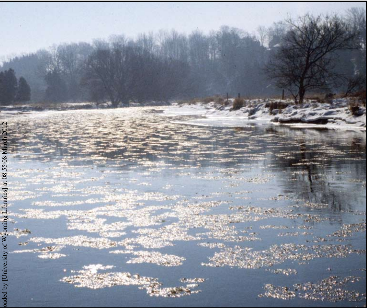
Figure 4. Frazil slush on the surface of the Grand River, Ontario.