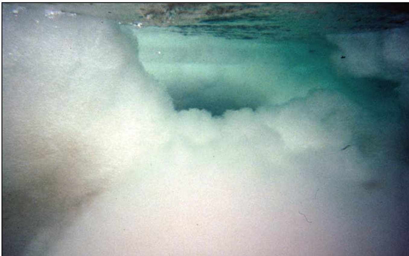
Figure 8. An underwater photo of a conduit through anchor ice in Dutch Creek Alberta. Most of the stream was covered in anchor ice leaving just a few of these high velocity conduits for water to pass through.

debris has been described as being used to provide protection from current and concealment for salmonids in many systems during winter (Meyer and Gregory 2000; Muhlfield et al. 2001; Harper and Farag 2004; Beechie et al. 2005; Muhlfield and Marotz 2005). Large woody debris and backwater habitats may be particularly important to salmonids during high-flow periods (Harvey et al. 1999, Brown et al. 2001). Many studies have described use of submerged aquatic vegetation as cover by salmonids during winter (Cunjak and Power 1986, 1987; Bendock and Bringham 1988; Heggenes et al. 1993; Griffith and Smith 1995; Mitro and Zale 2002). However, submerged aquatic macrophytes can deteriorate during winter, forcing fish to move and seek new habitat (Simpkins et al. 2000a). Instream cover in the form of rocks, large woody debris, and submerged aquatic vegetation have been shown to be an important winter habitat feature for several species of centrarchids as well (Carlson 1992; Cunjak 1996; Karchesky and Bennett 2004).