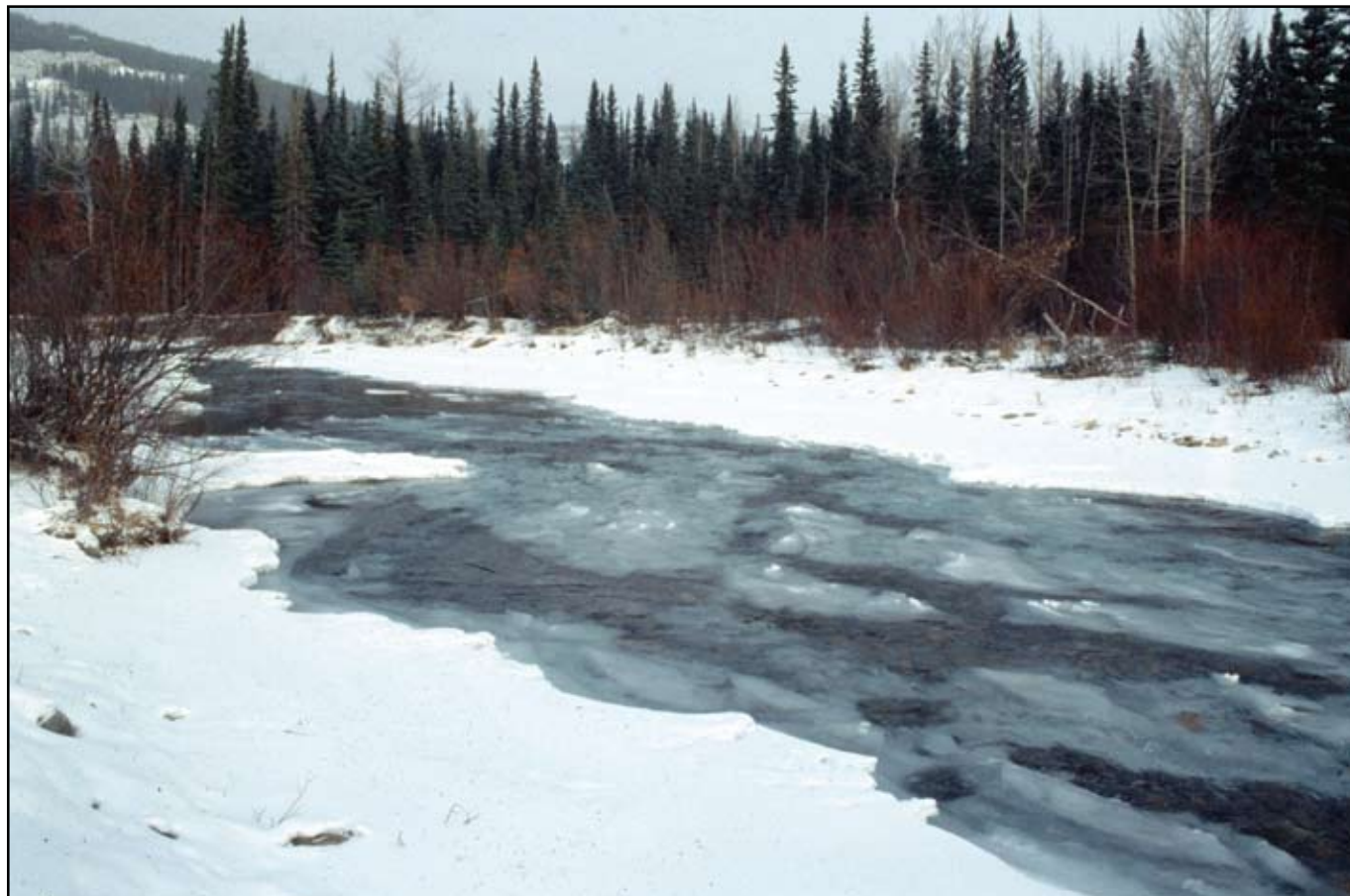
Figure 1. Patchy anchor ice on the North Ram River, Alberta.

ing groundwater input, snowfall, elevation, latitude, channel type, and channel size. Anthropogenic influences, such as hydroelectric dams, groundwater extraction, and construction of instream structures to improve fish habitat are additional factors that affect winter habitat conditions in lotic systems. These complexities make it difficult to understand the winter habitat needs and behaviors of stream-dwelling fish, particularly their responses to river ice dynamics and interactions between groundwater and river ice. This review provides descriptions of the interactions among complex environmental conditions and behaviors of stream-dwelling fish during winter in order for fisheries managers to understand the conditions that salmonids confront. We attempt to link environmental conditions to management needs, describe when salmonid movements occur during winter and why, and examine the instream habitats that may be unstable during winter and why. Concurrently, we describe the instream habitats that are likely to be stable during winter and may be candidates of protective measures or habitat improvements. This review focuses on rivers and streams in temperate regions where it is cold enough for waters to have